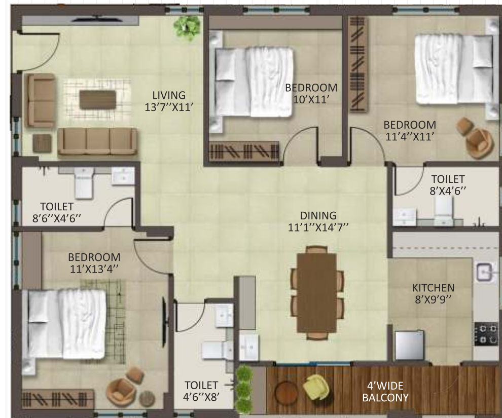
A3 3BHK - West Facing 1450sft.