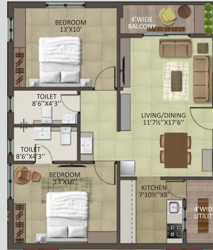
B5, B6 2BHK - East Facing 1030 sft.