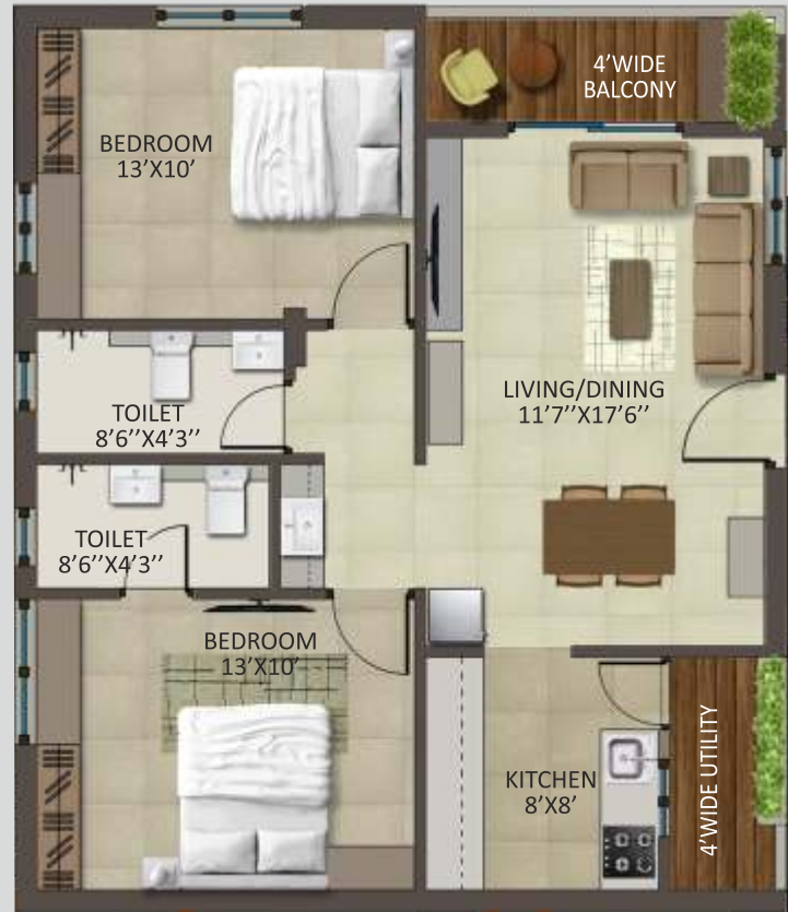
A1, A7 2BHK - East Facing 1030sft.