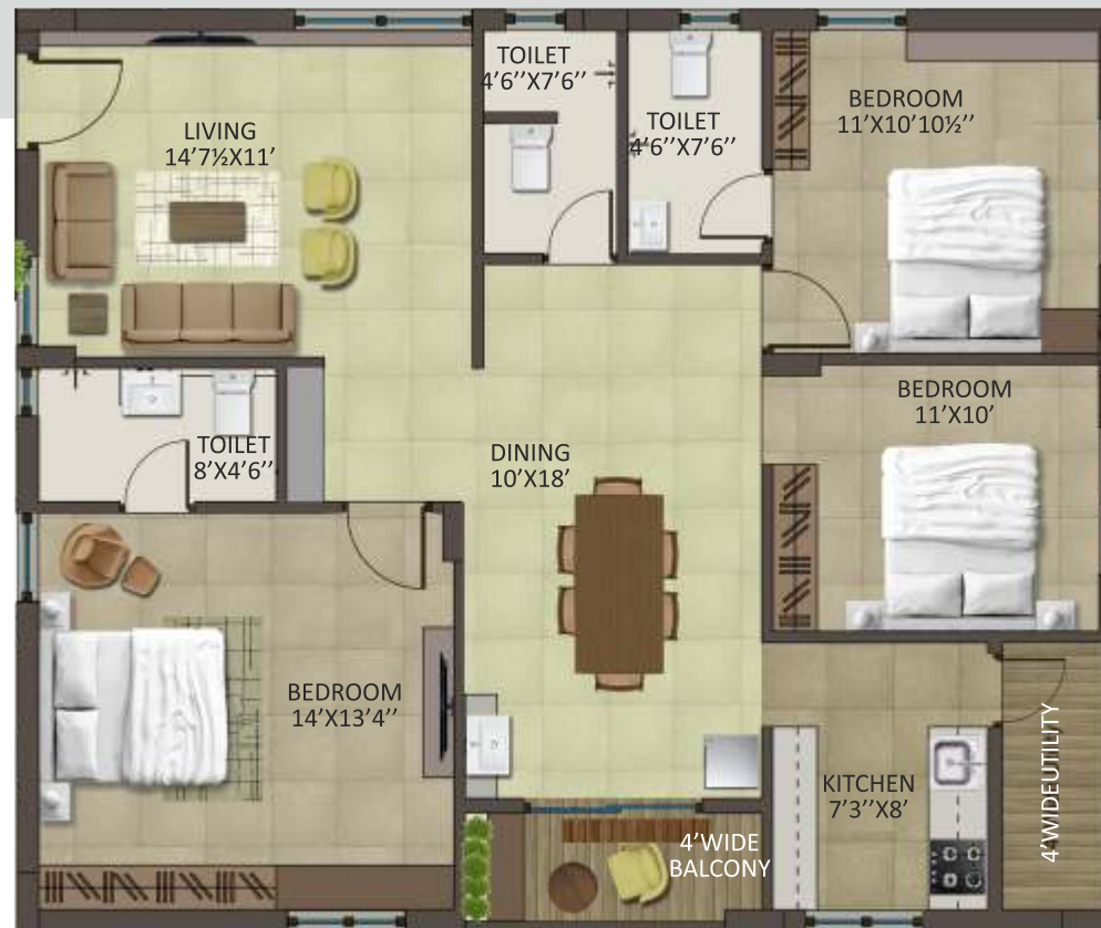
B8 3BHK - West Facing 1450 sft.