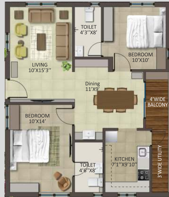
A2, A8 2BHK - West Facing 1030sft.