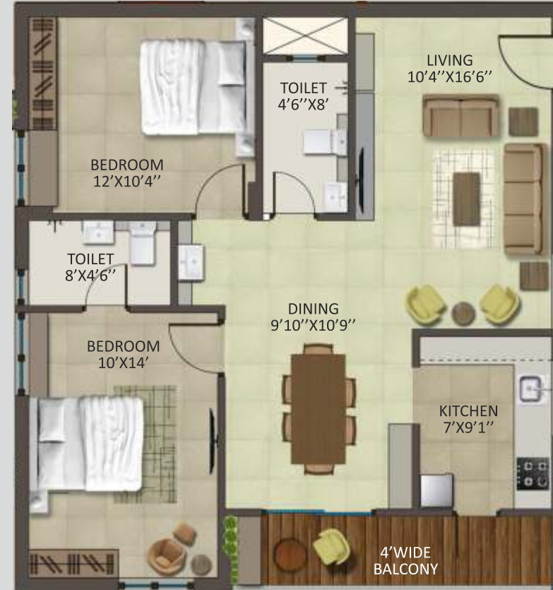
A4, A5 2BHK - East Facing 1135sft.