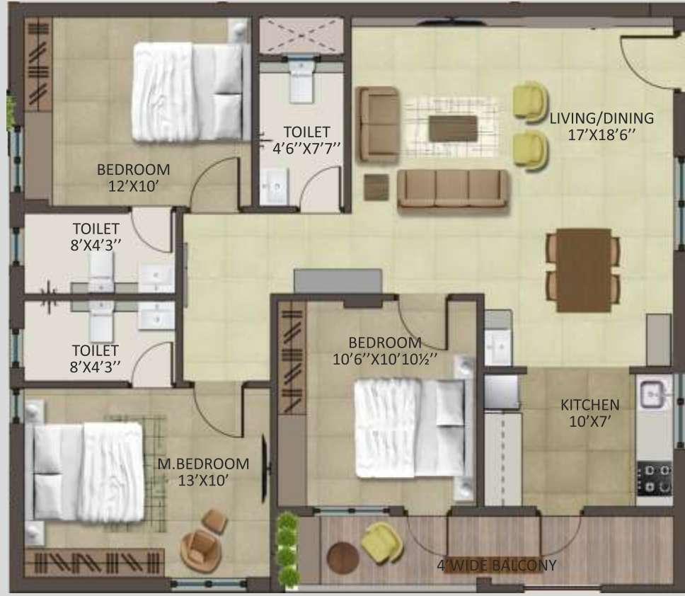
B1, B9 3BHK - East Facing 1385 sft.