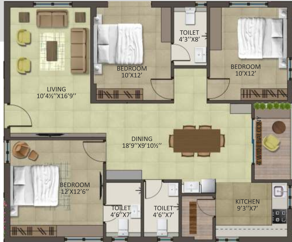
B7 3BHK - East Facing 1450 sft.