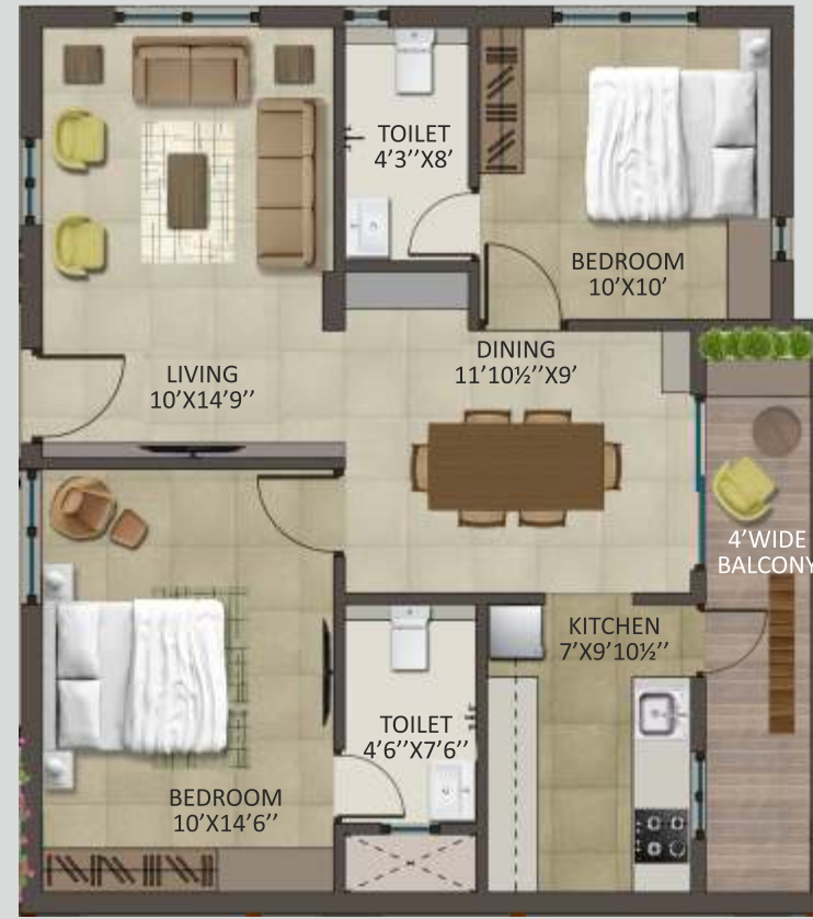
B4 2BHK - East Facing 1030 sft.