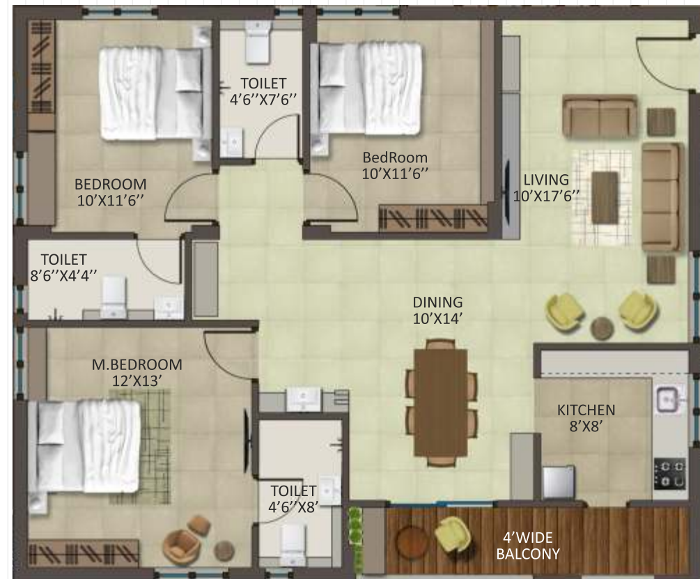
A6, B2, B3 3BHK - East Facing 1450sft.